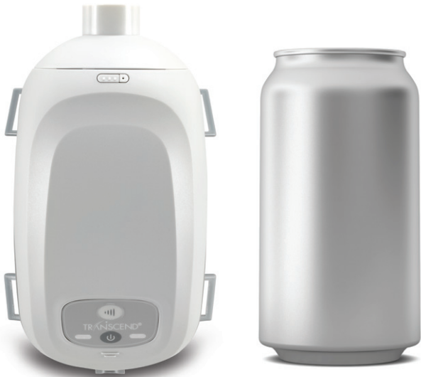
Items shown proportionate.

Transcend's fully-featured therapy devices are small, lightweight and portable. They are perfect for packing into a suitcase or taking up minimal space on the night stand.